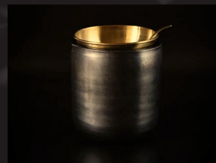
BURNER N.79 COPPER