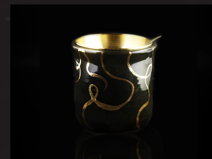
BURNER N.79 BRONZE