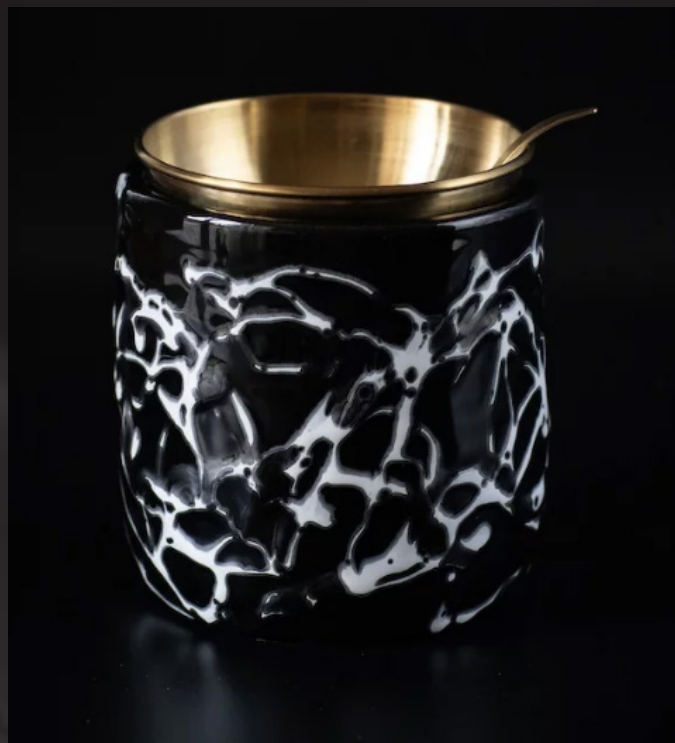
BURNER SCENE DRESS

The biting grace of the Marchesa is modeled on the style profile of the Maison's burners. In hand-made glazed Italian ceramic.