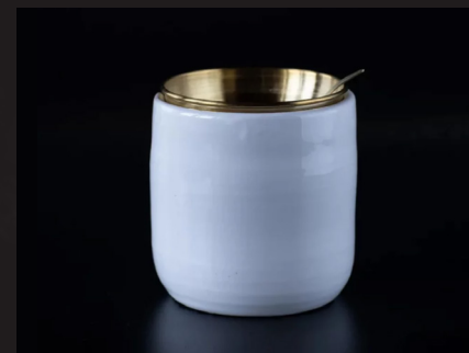
BURNER WHITE GOLD